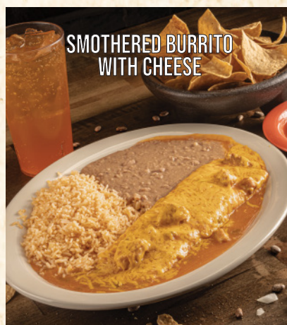
SMOTHERED BURRITO WITH CHEESE