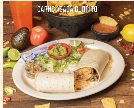
CARNE ASADA BURRITO