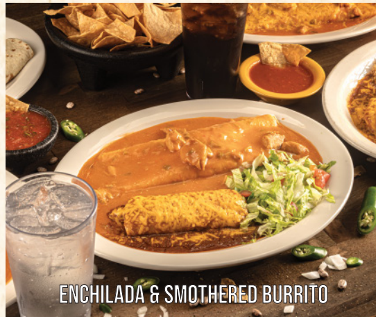
ENCHILADA & SMOTHERED BURRITO