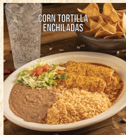
CORN TORTILLA ENCHILADAS