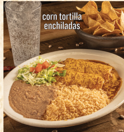
corn tortilla enchiladas