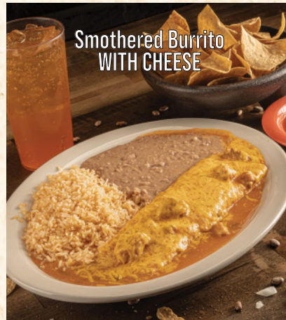
Smothered Burrito WITH CHEESE