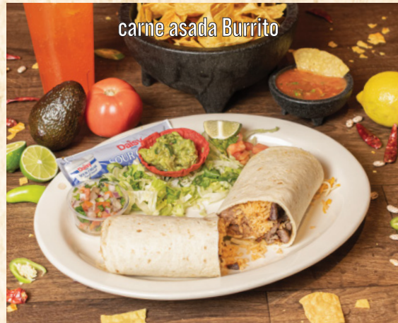
carne asada Burrito