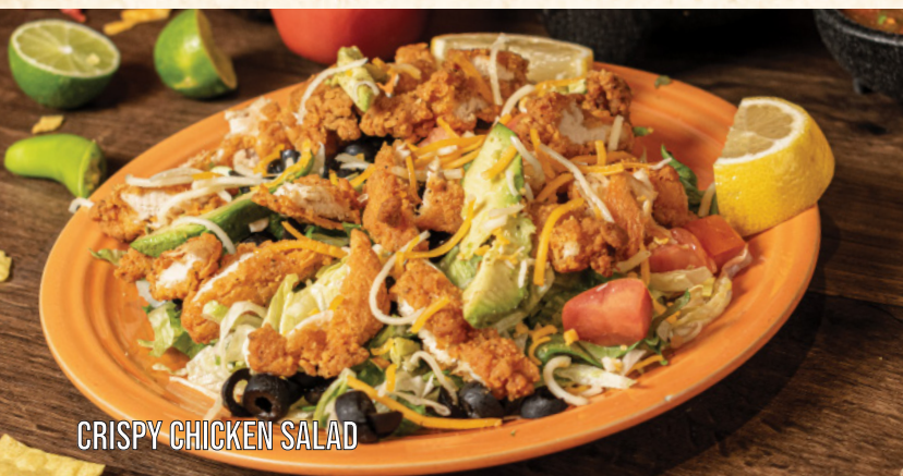
CRISPY CHICKEN SALAD