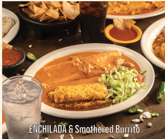
ENCHILADA & Smothered Burrito